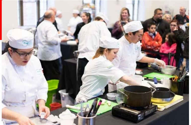
Colorado Career Cluster Model