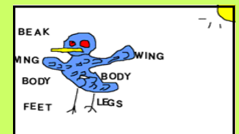
A first grader drew and labeled this bird diagram using KidPix.