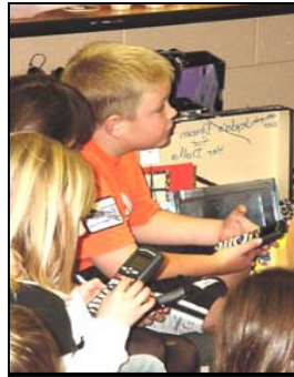
Using responders in class