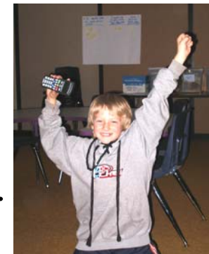
A student rejoices at a correct answer with his responder.

5370 Cracker Barrel Circle Colorado Springs, CO 80917 719-328-7600