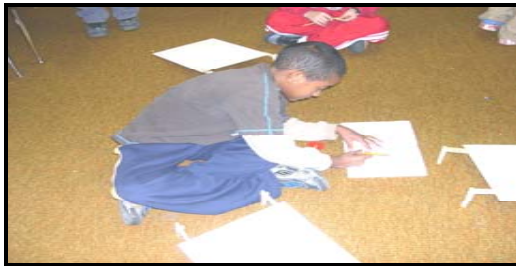
As he conducts an experiment with ramps in the Science Lab, this student records observations in his Science Notebook.