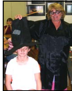
Students participating in Potions at Hogwarts, an afterschool class for 3rd to 5th grade students.