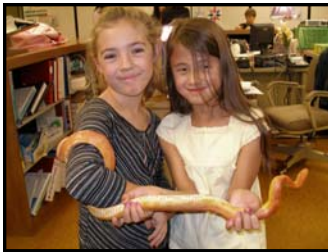
Two first grade girls cradle a live corn snake.