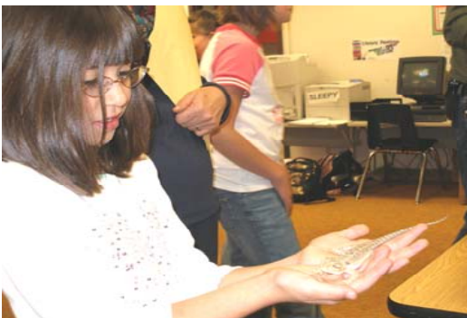
A second grade student examines a bearded dragon up close and personal.

Students receive instruction from a science specialist, as well as classroom teachers that focuses on the scientific process through hands on activities, reading materials and scientific writing.